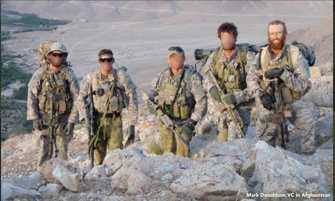
Mark Donaldson VC in Afghanistan