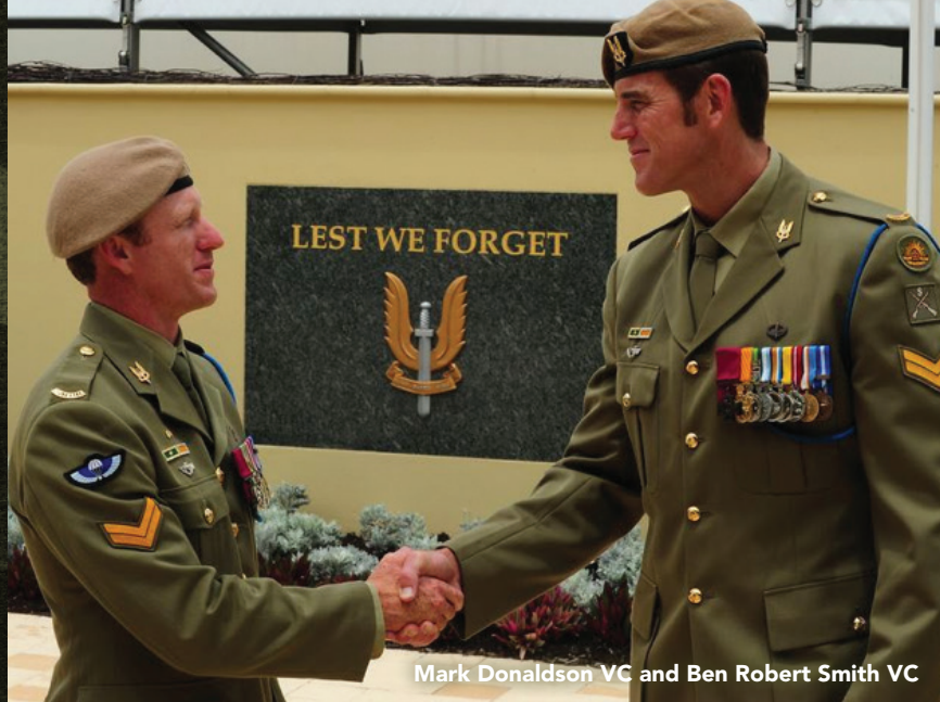
Mark Donaldson VC and Ben Robert Smith VC